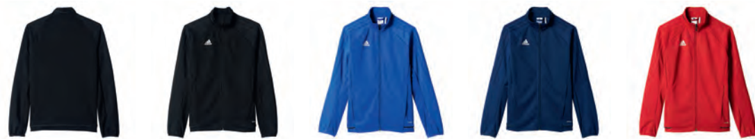
BJ9296 12/01/17 BR2701 12/01/17 BR2707 12/01/17 BR2704 12/01/17