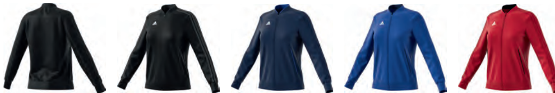
CV9079 11/01/17 CF4329 11/01/17 CF4328 11/01/17 CF4327 11/01/17