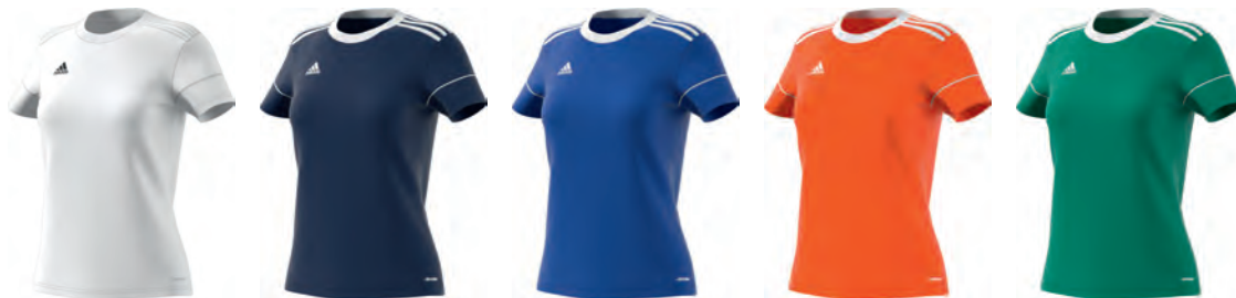
BJ9205 11/01/17 BJ9201 11/01/17 S99155 11/01/17 BJ9206 11/01/17 BJ9207 11/01/17

Dedication brings results. Create your chance and find the back of the net in this women's football jersey. Lightweight climalite wicks away moisture to keep you dry as you sharpen your skills on the pitch. 3-Stripes on the shoulders finish the look.