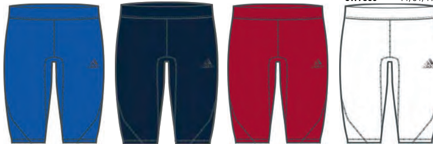
CW7349 11/01/17 CW7347 11/01/17 CW7348 11/01/17 CW7351 11/01/17

Youth Boys P Short Tight $22.00 SMSUS18FBTFSHTY