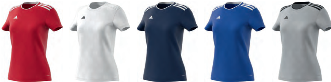
CF0700 11/01/17 CF0705 11/01/17 CF0702 11/01/17 CF0701 11/01/17 CE1705 11/01/17