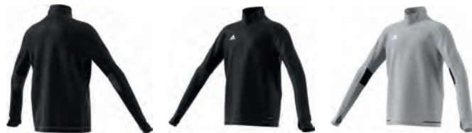
BK0293 12/01/17 BP6022 12/01/17