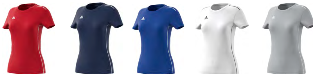
CY8272 11/01/17 CY8274 11/01/17 CY8273 11/01/17 CY8271 11/01/17 CY8269 11/01/17

Material: 100% Polyester Sizes: XXS | XS | S | M | L | XL | XXL