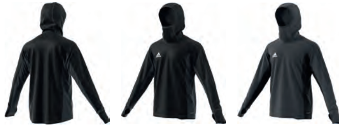
AY2867 12/01/17 BP5424 12/01/17