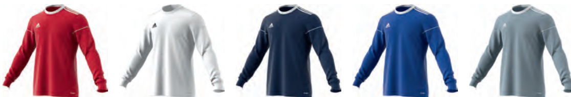
BJ9186 11/01/17 BJ9189 11/01/17 BJ9192 11/01/17 S99150 11/01/17 BR1977 11/01/17

Control the ball, control the game. Sharpening your soccer skills demands regular practice. This men's soccer jersey is designed to keep pace with your training. The long sleeve design features sweat-wicking fabric to keep you dry through every drill.