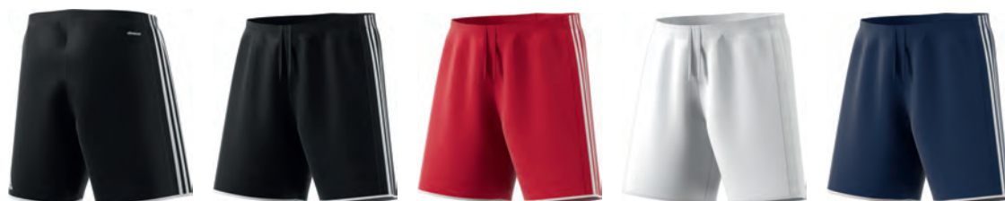
BJ9128 11/01/17 S99143 11/01/17 BJ9127 11/01/17 BJ9129 11/01/17