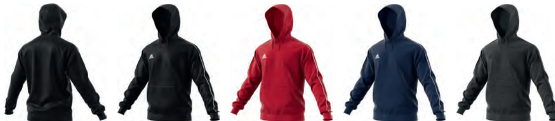
CE9068 11/01/17 CV3337 11/01/17 CV3332 11/01/17 CV3327 11/01/17