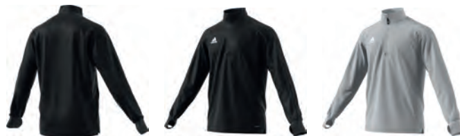
BS0602 11/01/17 CV8234 11/01/17