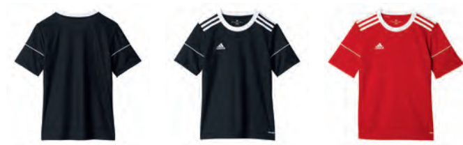
BJ9195 11/01/17 BJ9196 11/01/17