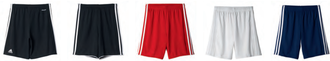
BJ9145 11/01/17 S99144 11/01/17 BJ9144 11/01/17 BJ9147 11/01/17