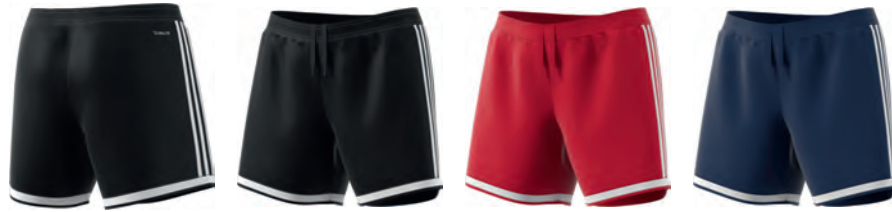
CF9584 11/01/17 CF9580 11/01/17 CF9582 11/01/17