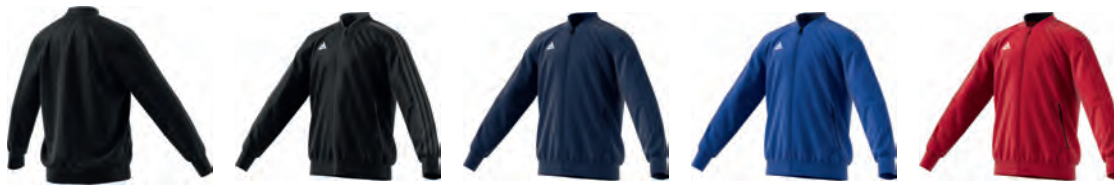
CF4338 11/01/17 CF4334 11/01/17 CF4336 11/01/17 CF4337 11/01/17