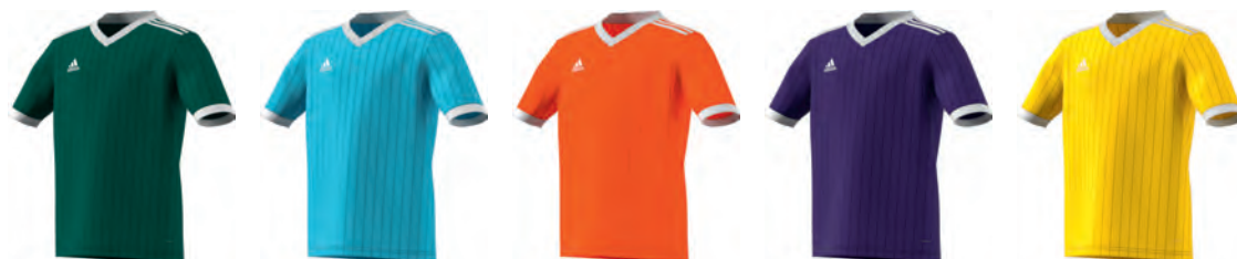
CE8927 11/01/17 CE8924 11/01/17 CE8922 11/01/17 CE8925 11/01/17 CE8921 11/01/17