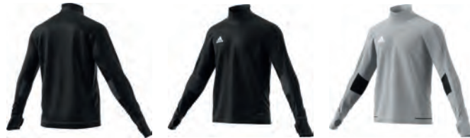
BK0292 12/01/17 BQ2741 12/01/17