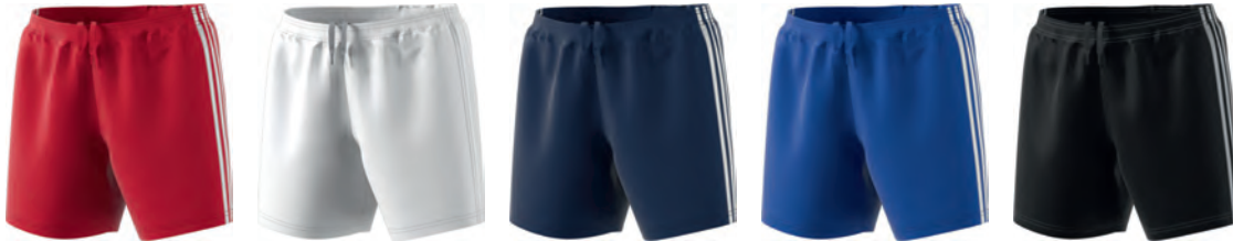
CF0724 11/01/17 CF0729 11/01/17 CF0726 11/01/17 CF0725 11/01/17 CE1704 11/01/17