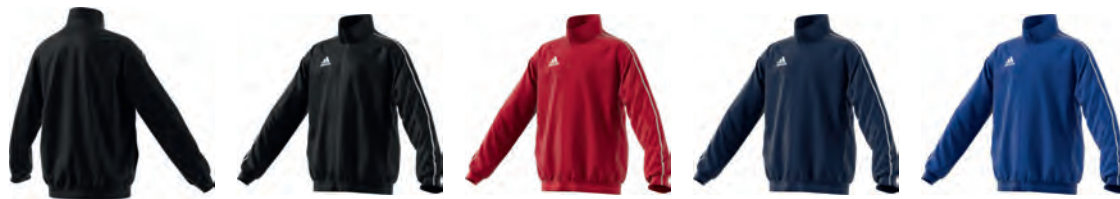
CE9044 11/01/17 CV3689 11/01/17 CV3687 11/01/17 CV3688 11/01/17