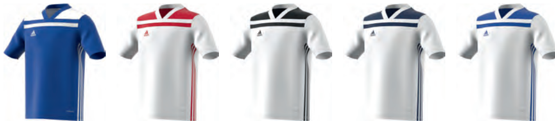
CE8959 11/01/17 CW2013 11/01/17 CE8962 11/01/17 CW2011 11/01/17 CW2012 11/01/17