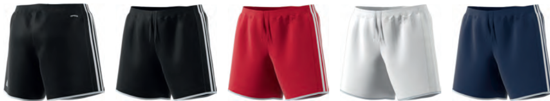
BJ9164 11/01/17 S99145 11/01/17 BJ9163 11/01/17 BJ9165 11/01/17