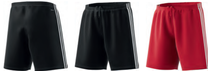
CF0709 11/01/17 CF0706 11/01/17