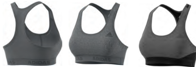
CE0789 12/01/17 CF6607 12/01/17

AlphaSkin SPRT BRA HEATHER $25.00 S1853WDNA120B