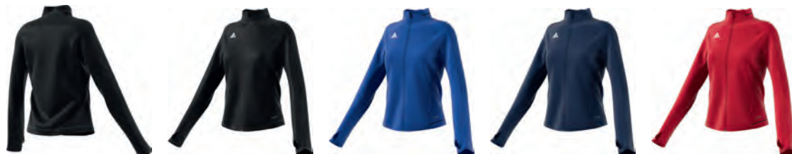
BK0387 12/01/17 BQ8245 12/01/17 BQ8248 12/01/17 BQ8243 12/01/17