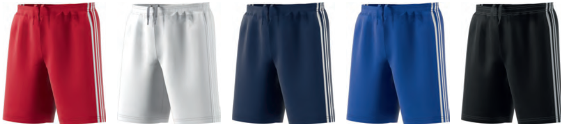
CF0694 11/01/17 CF0699 11/01/17 CF0697 11/01/17 CF0695 11/01/17 CE1707 11/01/17