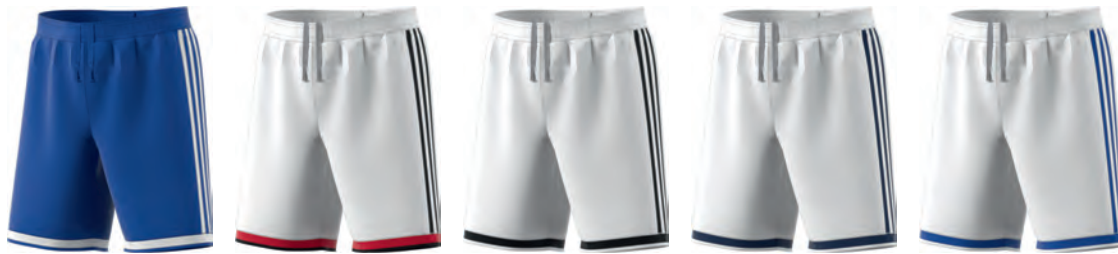
CF9587 11/01/17 CW2025 11/01/17 CF9590 11/01/17 CW2023 11/01/17 CW2024 11/01/17