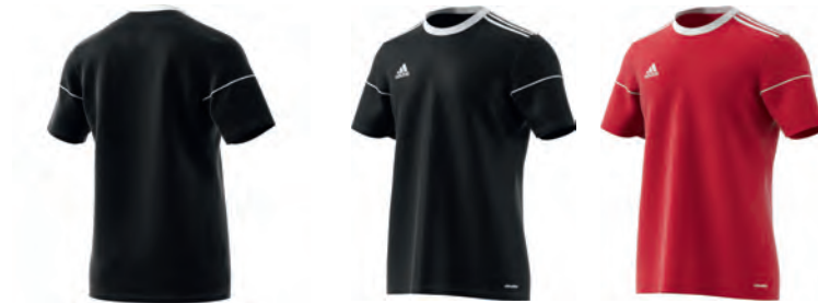
BJ9173 11/01/17 BJ9174 11/01/17