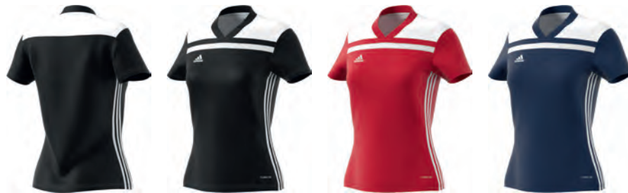
CE8956 11/01/17 CE8952 11/01/17 CE8954 11/01/17