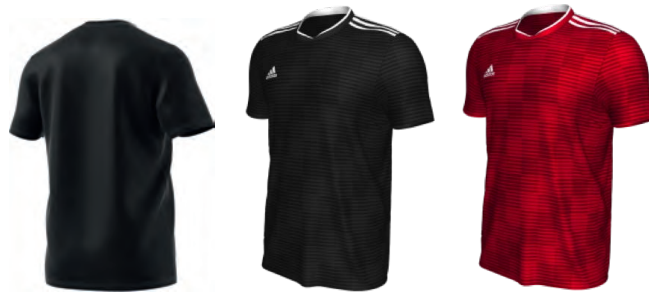
CF0679 11/01/17 CF0677 11/01/17