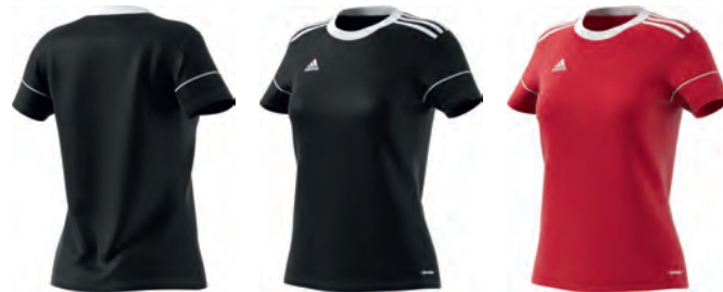
BJ9202 11/01/17 BJ9203 11/01/17