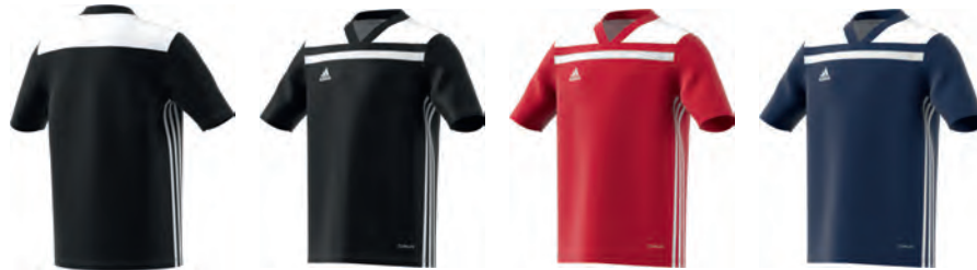
CE8961 11/01/17 CE8958 11/01/17 CE8960 11/01/17