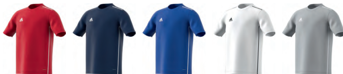
CV3496 11/01/17 CV3494 11/01/17 CV3495 11/01/17 CV3497 11/01/17 CV3499 11/01/17