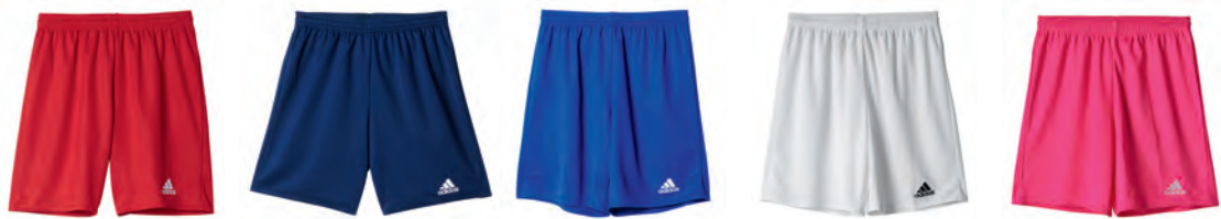
AJ5893 11/01/17 AJ5895 11/01/17 AJ5894 11/01/17 AC5256 11/01/17 AP0356 11/01/17

Keep defenders on their heels as you charge to the net with these junior boys' lightweight soccer short: Made with moisture-wicking climalite fabric, the so shorts will keep you dry when the match heats up.