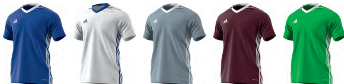
BK5439 11/01/17 BK5434 11/01/17 BS4211 11/01/17 BS4212 11/01/17 BK5428 11/01/17