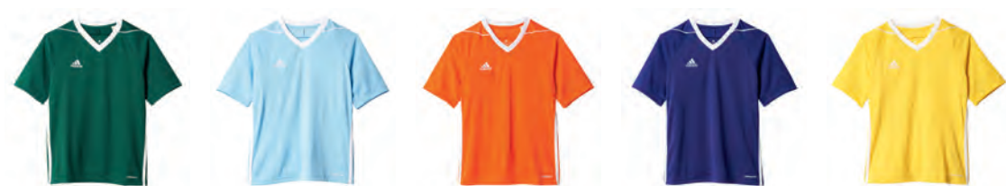
BS4237 11/01/17 BS4239 11/01/17 BS4240 11/01/17 BS4242 11/01/17 BS4241 11/01/17

Set the pace on and off the field in this junior boys' V-neck soccer jersey. It's made of smooth recycled interlock and includes breathable climacool with upper-back mesh inserts for targeted ventilation. The sleeves feature engineered fabric for a flash of style.