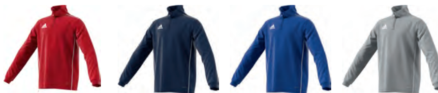
CV4141 11/01/17 CV4139 11/01/17 CV4140 11/01/17 CV4142 11/01/17