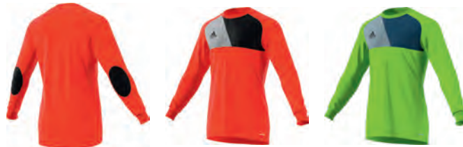
CV7749 11/01/17 CV7750 11/01/17