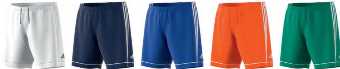
BJ9228 11/01/17 BK4765 11/01/17 S99153 11/01/17 BJ9229 11/01/17 BJ9231 11/01/17