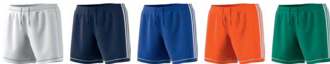
BK4780 11/01/17 BK4777 11/01/17 S99152 11/01/17 BK4781 11/01/17 BK4782 11/01/17

Confidence and skill win the ball. Work on both in these women's soccer shorts. Clean styling and 3-Stripes detail let you lead anywhere, anytime, while climalite sheds sweat to keep you dry and ready to play until the whistle.