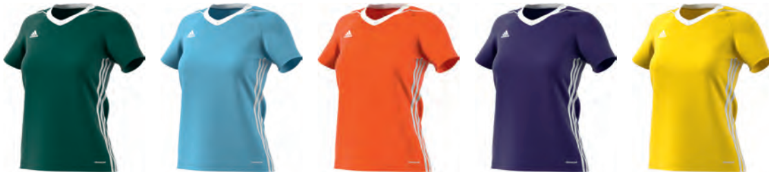
BS4227 11/01/17 BS4228 11/01/17 BS4229 11/01/17 BS4232 11/01/17 BS4231 11/01/17

Honing your soccer skills means regular practice, and this women's soccer jersey is designed for the pitch. Featuring moisture-wicking fabric, the slim-fit jersey is a go-to workout shirt.