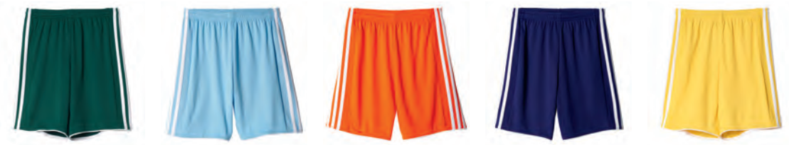
BS4262 11/01/17 BS4264 11/01/17 BS4265 11/01/17 BS4268 11/01/17 BS4266 11/01/17