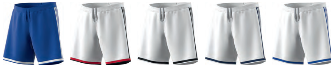
CF9600 11/01/17 CF9601 11/01/17 CF9594 11/01/17 CF9597 11/01/17 CF9596 11/01/17