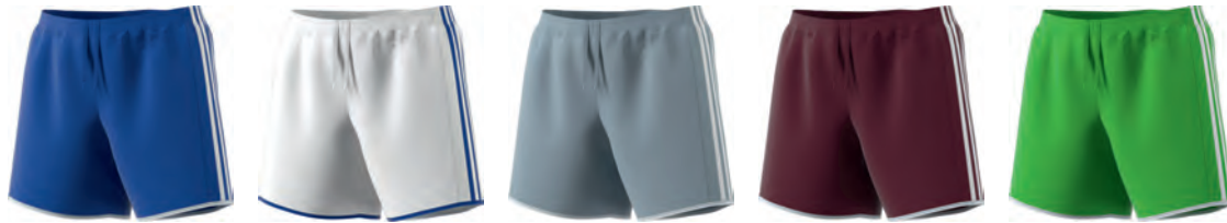
BJ9166 11/01/17 BJ9161 11/01/17 BS4269 11/01/17 BS4270 11/01/17 BJ9152 11/01/17