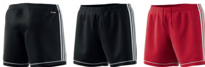
BK4778 11/01/17 BK4779 11/01/17