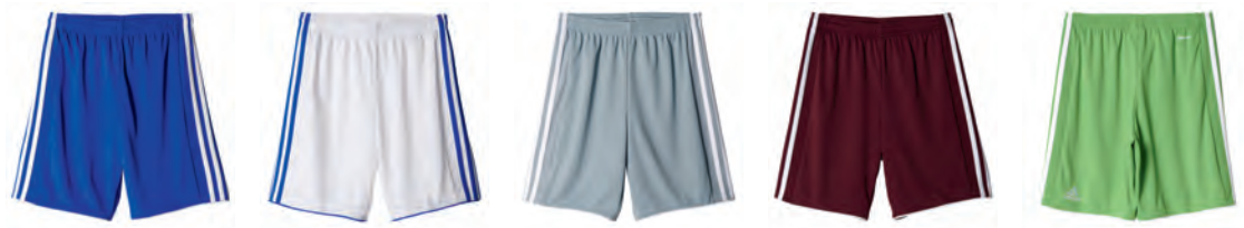
BJ9148 11/01/17 BJ9143 11/01/17 BS4260 11/01/17 BS4261 11/01/17 BJ9137 11/01/17