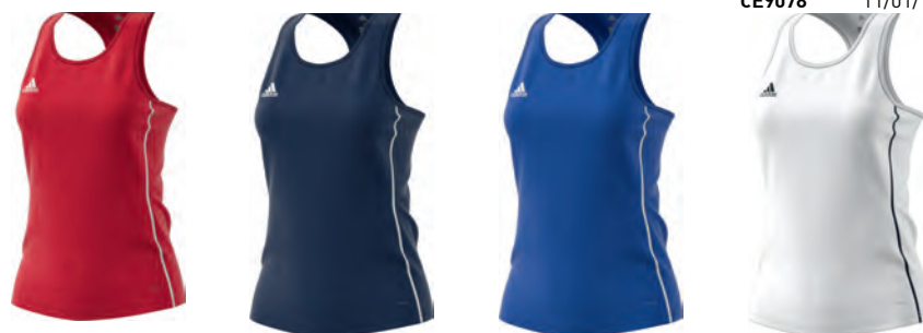
CV3973 11/01/17 CV3971 11/01/17 CV3972 11/01/17 CV3974 11/01/17