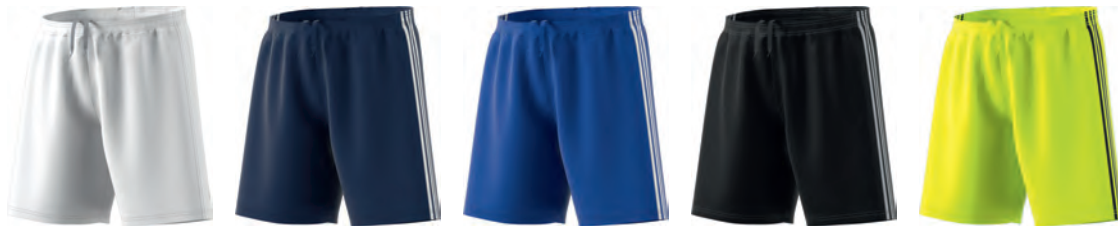
CF0710 11/01/17 CF0708 11/01/17 CF0723 11/01/17 CF0714 11/01/17 CF0715 11/01/17