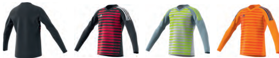
CV6358 11/01/17 CF6174 11/01/17 CV6356 11/01/17