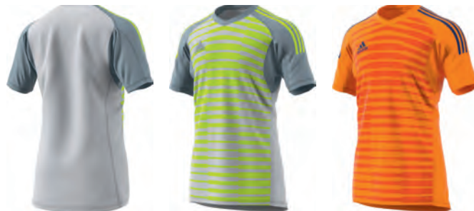
CV6361 11/01/17 CV6362 11/01/17

CV6349 lucky orange s15/orange/unity ink f16