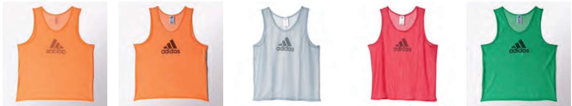
F82133 11/01/17 D84856 11/01/17 F82134 11/01/17 F82135 11/01/17

TRG BIB 14 $12.00 S1406GHTM800 Sizes: S | M | L | XL F82133 glow orange s14 D84856 silver F82134 vivid berry s14 F82135 vivid green s14