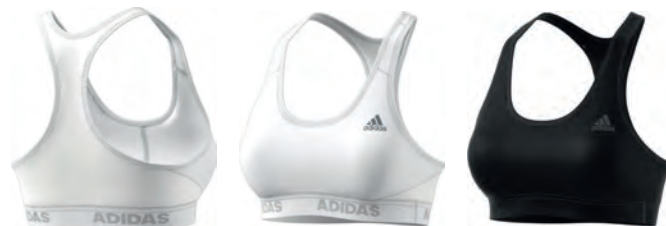
CE0786 12/01/17 CF6599 12/01/17

Material: 83% rec polyester/17% Elasthane