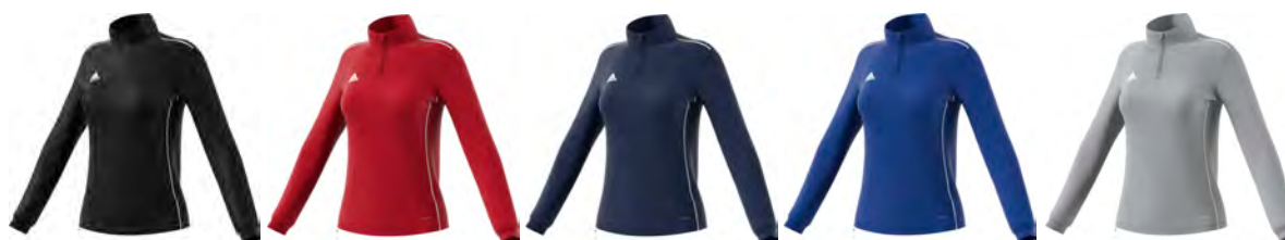
CY8268 11/01/17 CY8265 11/01/17 CY8267 11/01/17 CY8266 11/01/17 CY8264 11/01/17