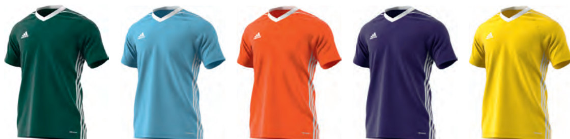
BS4213 11/01/17 BS4215 11/01/17 BS4216 11/01/17 BS4219 11/01/17 BS4217 11/01/17