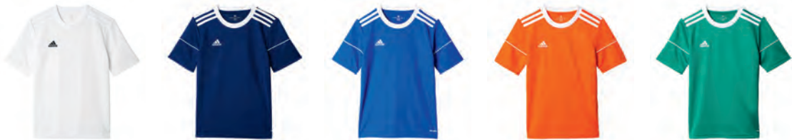
BJ9197 11/01/17 BJ9194 11/01/17 S99151 11/01/17 BJ9198 11/01/17 BJ9200 11/01/17

Confidence and skill win the ball. Work on both in this junior boys' soccer jersey. Featuring climalite to shed sweat, keep dry and let you focus on ball, so you can play to the whistle. Finished with an adidas landmark on right chest.