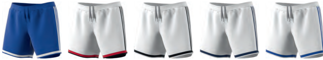
CF9581 11/01/17 CW2022 11/01/17 CF9585 11/01/17 CW2020 11/01/17 CW2021 11/01/17