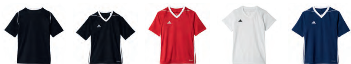
BJ9112 11/01/17 S99148 11/01/17 BJ9111 11/01/17 BJ9113 11/01/17