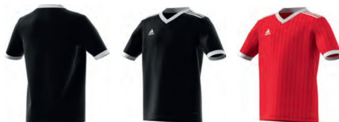
CE8918 11/01/17 CE8914 11/01/17