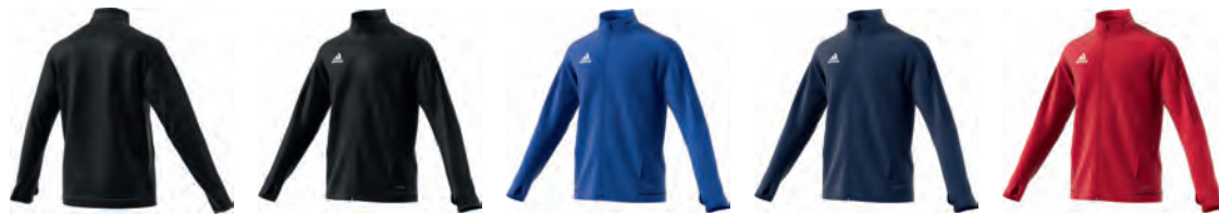
BJ9294 12/01/17 BQ8201 12/01/17 BQ8199 12/01/17 BQ8196 12/01/17