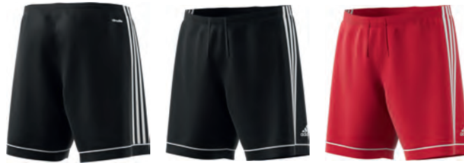
BK4766 11/01/17 BJ9226 11/01/17