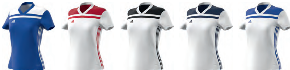
CE8953 11/01/17 CW2010 11/01/17 CE8957 11/01/17 CW2008 11/01/17 CW2009 11/01/17