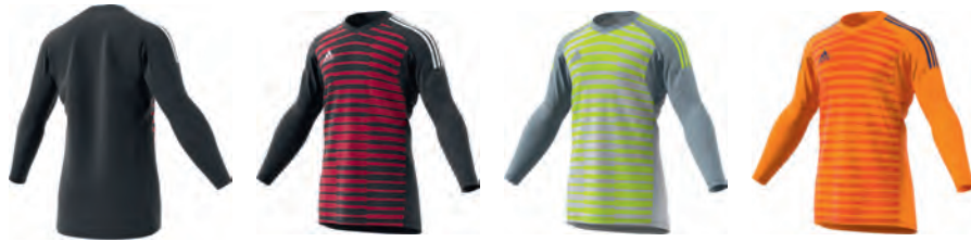
CF6173 11/01/17 CV6351 11/01/17 CV6349 11/01/17