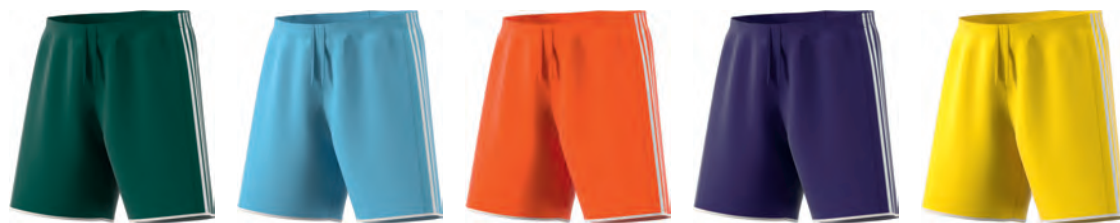
BS4253 11/01/17 BS4254 11/01/17 BS4256 11/01/17 BS4258 11/01/17 BS4257 11/01/17