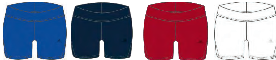
CX3683 11/01/17 CX3682 11/01/17 CX3681 11/01/17 CX3684 11/01/17

Material: 83% rec polyester/17% Elasthane