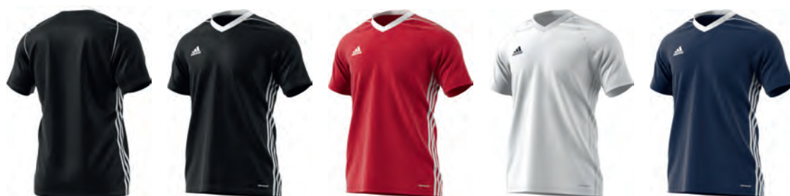
BK5437 11/01/17 S99146 11/01/17 BK5435 11/01/17 BK5438 11/01/17