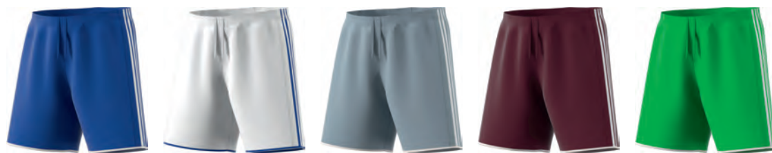
BJ9131 11/01/17 BJ9126 11/01/17 BS4250 11/01/17 BS4252 11/01/17 BJ9121 11/01/17