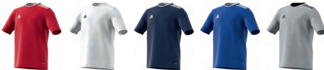
CF0689 11/01/17 CF0693 11/01/17 CF0691 11/01/17 CF0690 11/01/17 CE1706 11/01/17