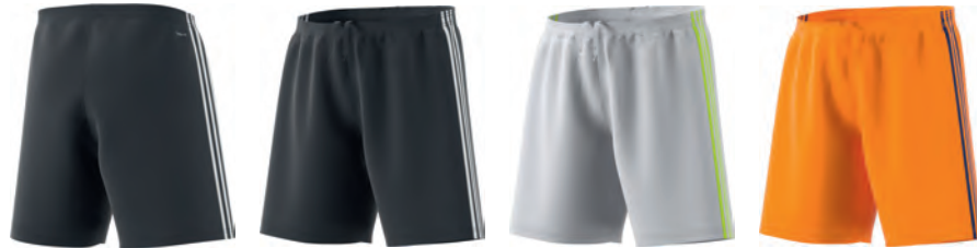
CE1699 11/01/17 CE1702 11/01/17 CE1700 11/01/17