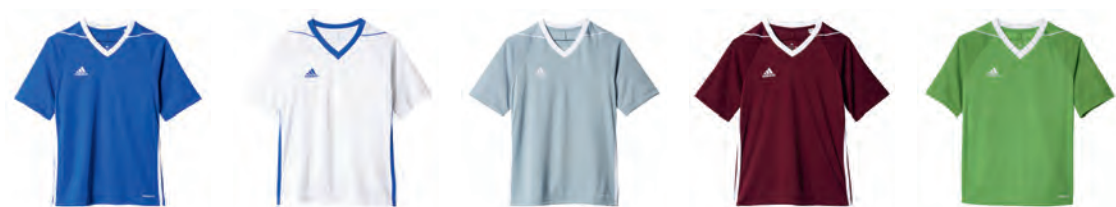
BJ9114 11/01/17 BJ9110 11/01/17 BS4235 11/01/17 BS4236 11/01/17 BJ9103 11/01/17