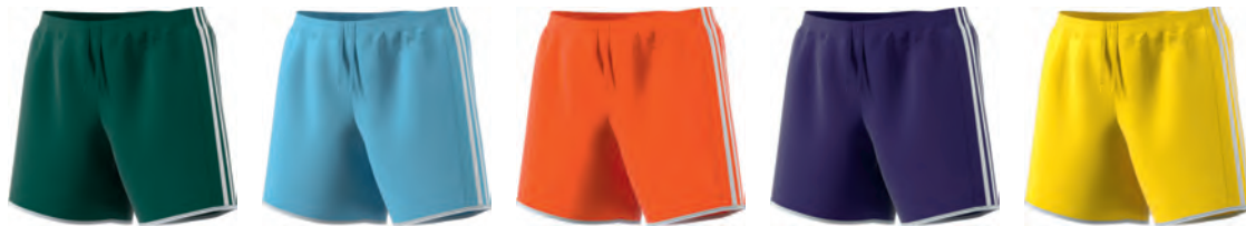
BS4271 11/01/17 BS4273 11/01/17 BS4274 11/01/17 BS4277 11/01/17 BS4275 11/01/17

Control the ball. Find the back of the net. These women's soccer shorts are ready to help you lead the charge. They feature a lightweight, ventilated design that keeps the air moving so you can focus on the ball.