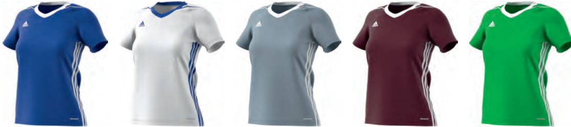
BJ9098 11/01/17 BJ9093 11/01/17 BS4224 11/01/17 BS4225 11/01/17 BK5444 11/01/17