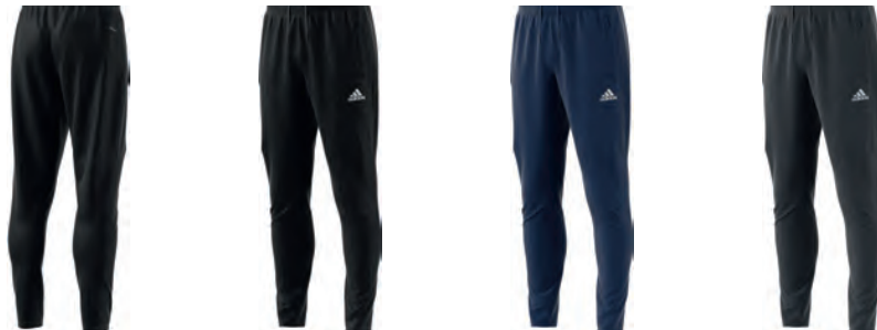
BK0348 12/01/17 BQ2719 12/01/17 BQ2718 12/01/17

Train hard. Stay cool. These men's soccer training pants help you warm up without overheating. Featuring ventilated climacool and mesh inserts for maximum breathability, they keep the air moving while you stay on the pitch. A slim fit promotes easy footwork.