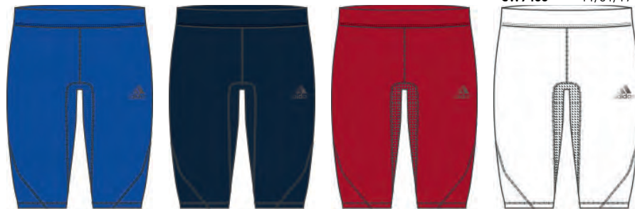
CW9458 11/01/17 CW9459 11/01/17 CW9460 11/01/17 CW9457 11/01/17

Material: 83% rec polyester/17% Elasthane