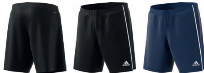
CE9031 11/01/17 CV3995 11/01/17