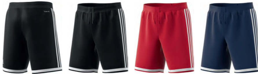
CF9589 11/01/17 CF9586 11/01/17 CF9588 11/01/17