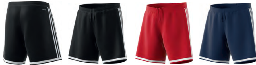
CF9593 11/01/17 CW2019 11/01/17 CF9592 11/01/17