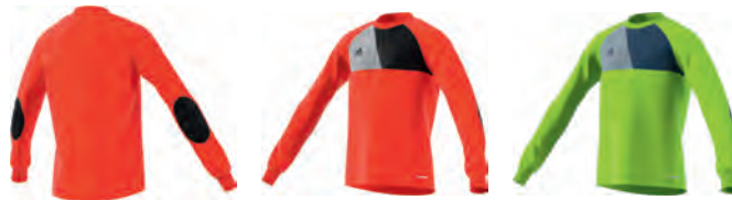
CV7748 11/01/17 CV7747 11/01/17

Command attention on and off the pitch in this junior boys' soccer goalkeeper jersey. It's made with soft, moisture-wicking fabric for dry comfort. Stretchy cuffs keep the sleeves from riding up, while padded elbows add protection.