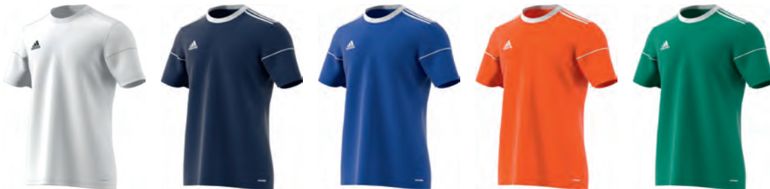
BJ9176 11/01/17 BJ9171 11/01/17 S99149 11/01/17 BJ9177 11/01/17 BJ9179 11/01/17

Control the ball, control the game. Sharpening your soccer skills demands regular practice. This men's soccer jersey is designed to keep pace with your training. Featuring sweat-wicking fabric to keep you dry through every drill.