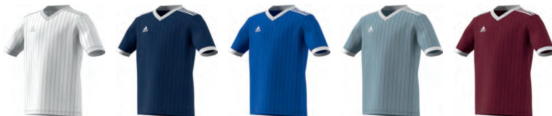
CE8919 11/01/17 CE8917 11/01/17 CE8916 11/01/17 CE8920 11/01/17 CE8926 11/01/17