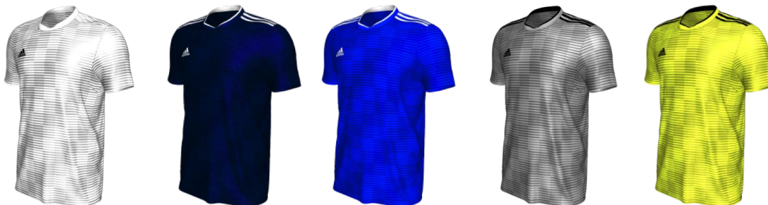
CF0681 11/01/17 CF0678 11/01/17 CF0687 11/01/17 CF0684 11/01/17 CF0685 11/01/17