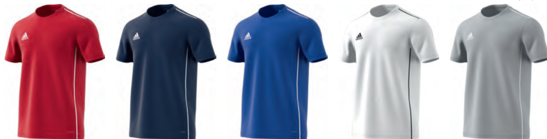
CV3452 11/01/17 CV3450 11/01/17 CV3451 11/01/17 CV3453 11/01/17 CV3462 11/01/17