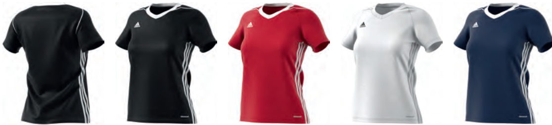
BJ9096 11/01/17 S99147 11/01/17 BJ9095 11/01/17 BJ9097 11/01/17