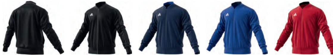
CF4325 11/01/17 CF4319 11/01/17 CF4321 11/01/17 CF4322 11/01/17